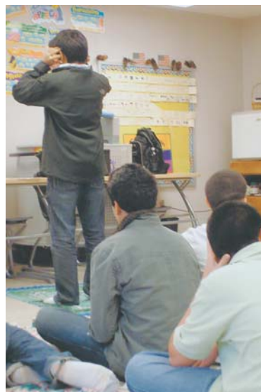
One of the Muslim students at Chantilly High School says the call to prayer.